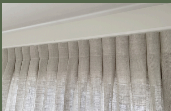
Relaxed Inverted Pleat